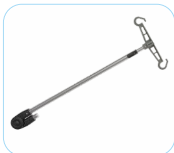
Infusion holder set Item no: ACR01045