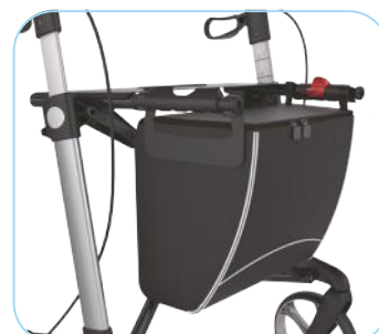
Waterproof bag with zipper Item no: ACR01028