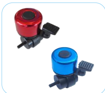
Rollator bell Item no: Blue: ACR01007 Red : ACR01007R