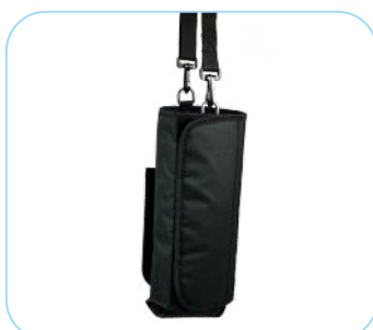
Oxygen bottle holder Item no: ACR01008