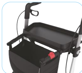
Serving tray incl. anti-slip matt Item no: ACR0100BCL