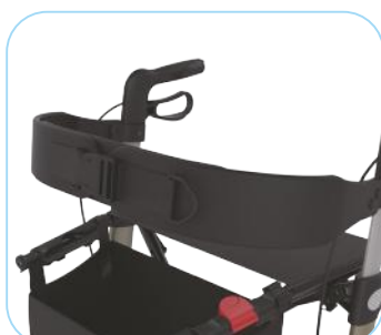
Adjustable backrest Item no: ACR01009A