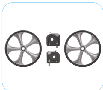
Slow down brake with std. rear wheel Item no: ACR01041