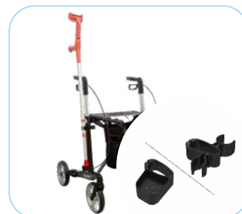
Crutch holder set Item no: ACR01043